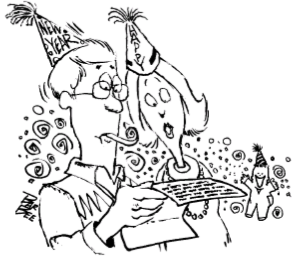
"Due to your reprehensible lack of discipline and flagrant disregard for your credit limit, you have been selected Customer of the Year!"

© Copyright 2003 Jan [Barber and Champagne Library] All rights reserved.